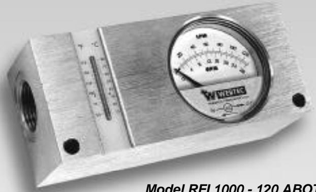
Model RFI 1000 - 120 ABOT 120 lpm Oil flow indicator with thermometer

The RFI reversible flow indicator is designed for continuous monitoring or intermittent use commissioning and servicing hydraulic systems up to 420 bar, 6000 psi.