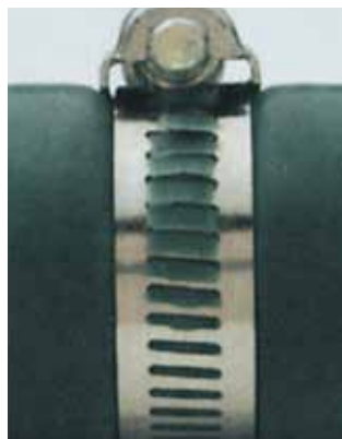
Hose installed with unlined clamp