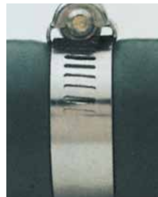
Hose installed with lined clamp