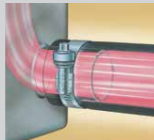
Flex-Gear™ adjusts with the hose and fitting to maintain constant tension on the connection, eliminating leak paths