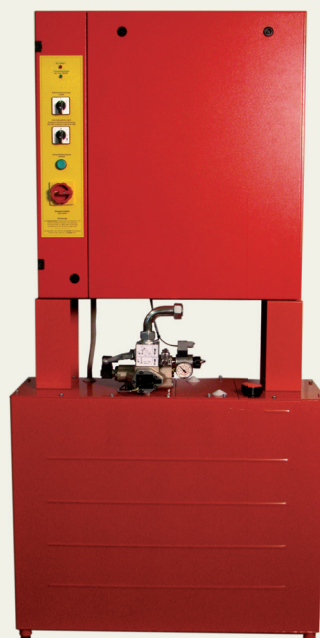
Power unit with iValve and control cabinet