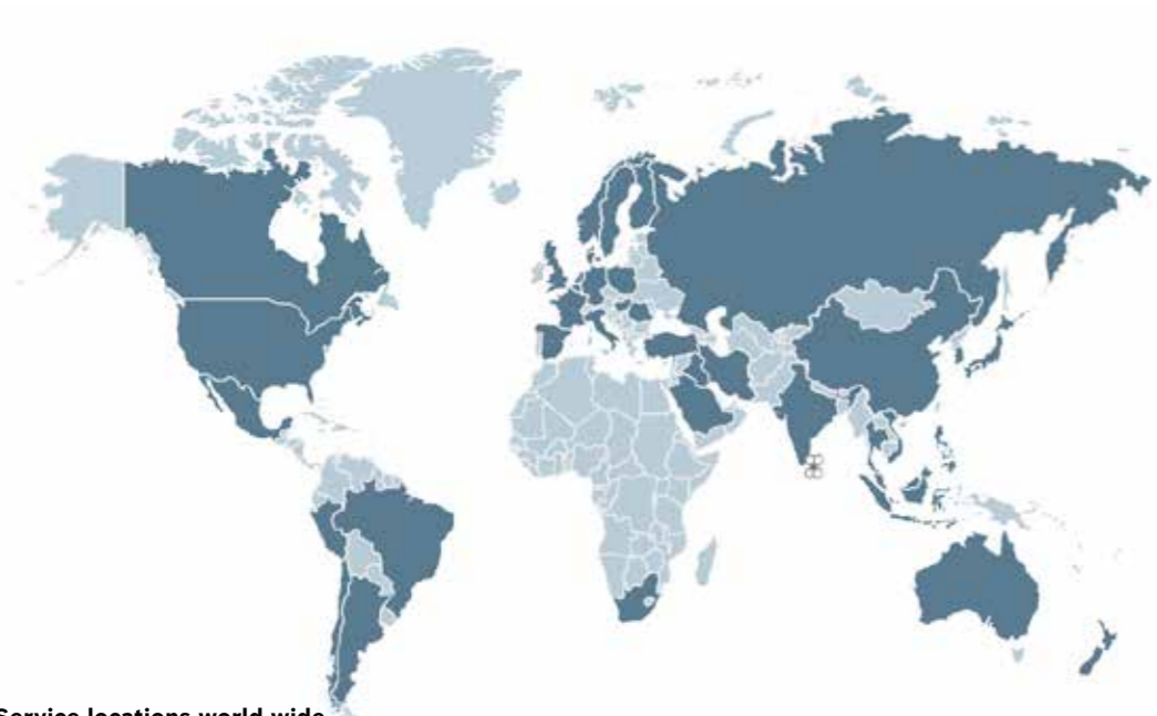
Service locations world-wide