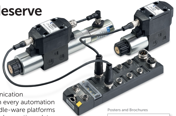
Posters and Brochures

The IO-Link communication protocol for on-off and proportional valves enables bidirectional data transmission functions using standard wiring. Continental has introduced the IO-Link communication protocol to allow integration with every automation system, such as PLCs and middle-ware platforms that collect smart connected operations data.