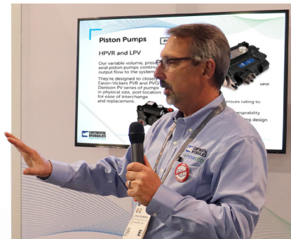
Vonn presenting at ConExpo 2020

If you are in need of more product knowledge to help you apply them better, let us know so we can work out the details and make it happen.