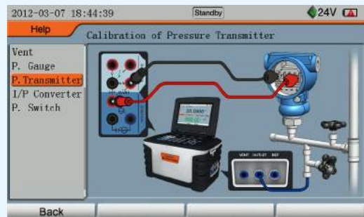
Built-in User's Manual